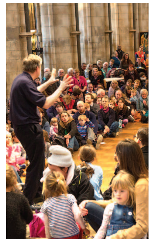
Messy Celebration at Southwark Cathedral

Then as you go forward it will probably look a bit like the following diagram: