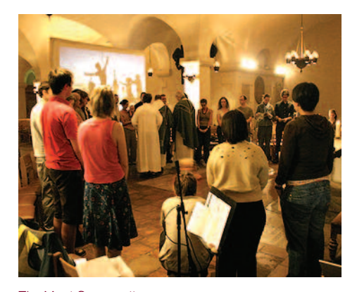
The Moot Community

A fresh expression of Church complements existing forms of Church and comes into being alongside them. They seek to be both missional (help people to come to faith) and ecclesial (they form a new congregation or church and don't just act as a bridge). They come in all shapes and sizes – from church plants through messy churches and missional community-based churches to neo-monastic churches. They have been able to reach parts of the community that our churches have traditionally found difficult to reach.